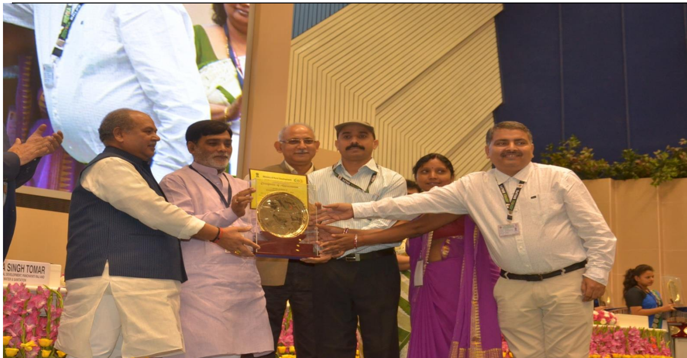
The Hon'ble Minister Shri Narendra Singh Tomar, Ministry of Rural Development & Panchayati Raj and Shri Ram Kripal Yadav, State Minister, MoRD & PR awarded Financial Inclusion Team of JEEViKA for the best performing states in Credit Linkage to SHGs for the FY 2016-17.

The focused areas were capacity building, bank linkage through saving account opening and credit linkage, disbursement of the approved loans, financial literacy, alternate banking, digital financing, availability of books of records at community institution level, books of record updation at field level, micro insurance and claim settlement.