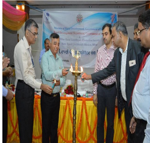
Inauguration of State Level RSETI Committee Meeting on 25 th April, 2017

During this quarter (April- June, 2017), 10 Job fairs organized in 10 districts and 1296 candidates placed through Job Fairs and direct placement. Cumulative placement through job fair and direct placement till June 2017 is 97,668.